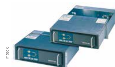
IT 039 C