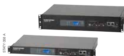
STATYS 068 A