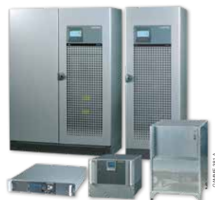
STATYS 381 A

Please contact us for any other requirement.