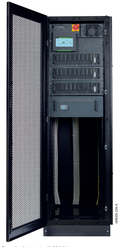
Example of integration (3x25 kW). Only 15 U of rack space occupied: space-saving design leaving free space for other rack-mounted devices. One empty slot in the MODULYS RM GP sub-rack remains available for power upgrade or redundancy.