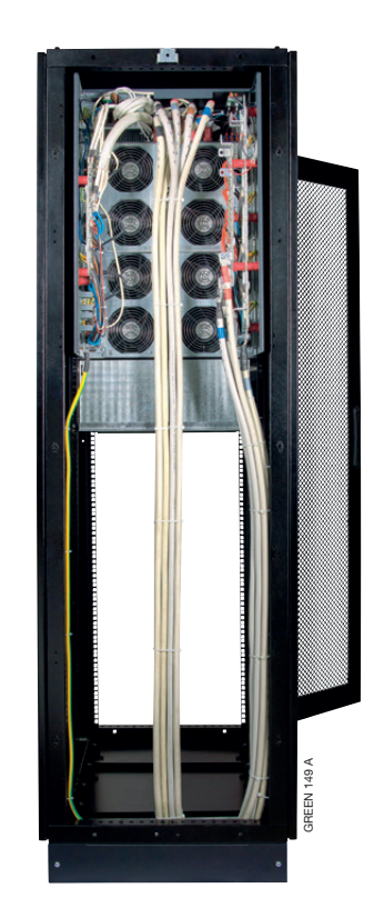
Rear view (before adding rear protective cover). Flexible cabling management for easy connections and tidier cabling.